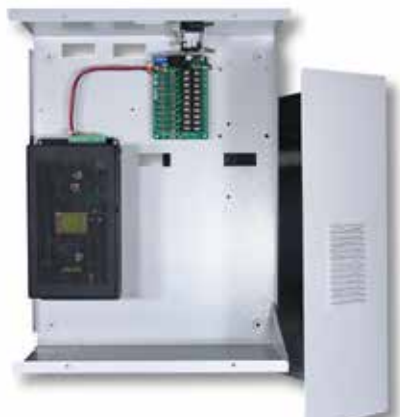
TP Medium-Kit, Power Module & PDM

PO Box 90 Kurrajong NSW 2758 Australia Tel +61 1300822769 sales@tacpower.com.au